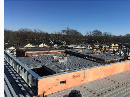
Roof Deck at Kitchen, AHU Curbs, & Parapets