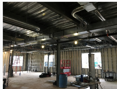
MEP Installation at New Building