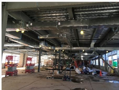
MEP Rough at Interior of New Building