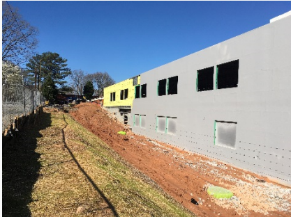
Exterior Sheathing, Air Barrier, & Brick Clips