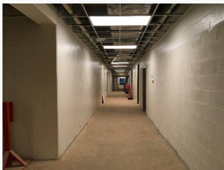
Lighting Installed at Renovation