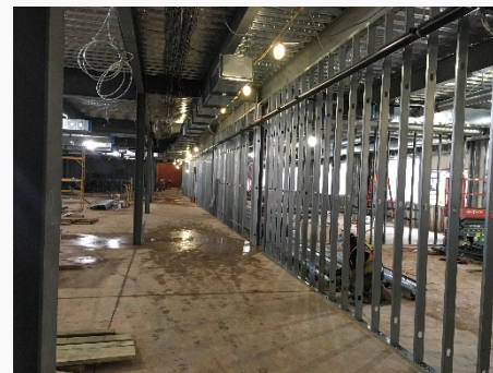
Interior Framing at New Building