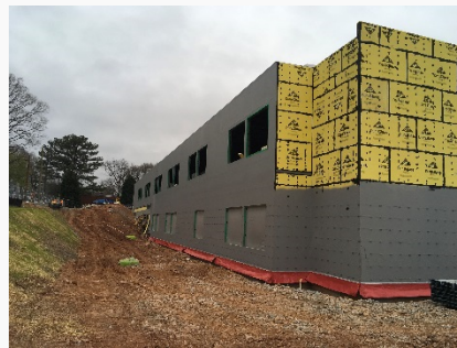
Exterior Sheathing, Air Barrier, & Brick Clips