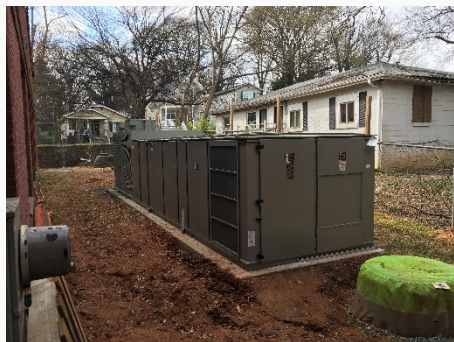
HVAC Units Set