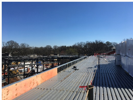
Roof Decking, Insulation, & AHU Curbs